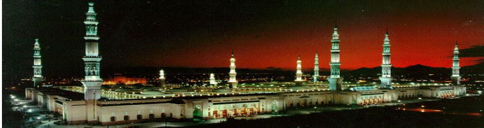
Magnificent View of The Prophet's Mosque

To visit Madinah is not a Hajj or Umrah rite, but the unique merits of the Prophet's city, his Mosque and his sacred tomb attract every pilgrim to visit it. There is no Ihram nor talbiyah for the visit to Madinah or the Prophet's Mosque.